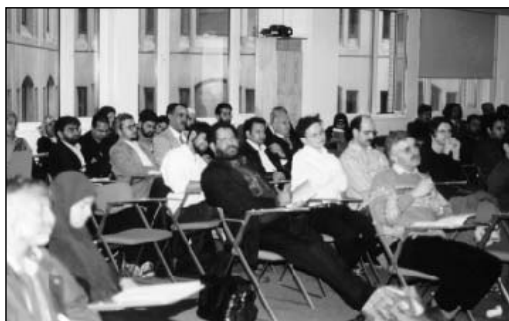
Conference participants at the LSE

The encouraging feedback and messages of support received both during and immediately after the conference were a further testament to and factor in the conference's success. This made the Executive Committee feel more energised and committed to the extent that it decided to expand the team further by establishing an Advisory Board to work closely with the